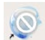
Example of application no longer running

You may find that some applications on your system have a gray crossed-out circle on them, indicating they will no longer run. If you identify such an application, you will need to download and install an updated version of that software that supports macOS 12 or higher. Please let us know if you experienced this so we can advise other users.